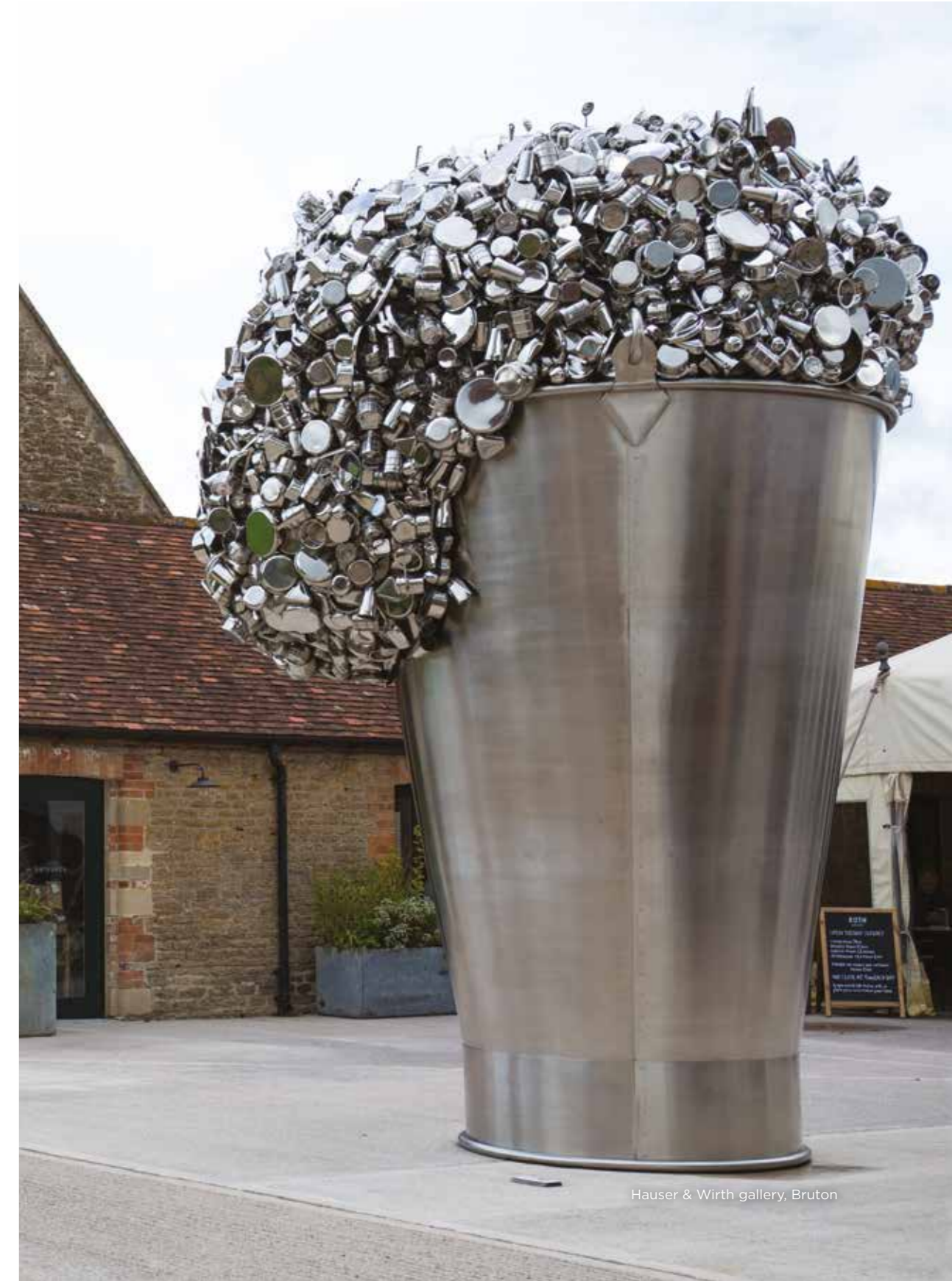
Hauser & Wirth gallery, Bruton

Bruton is also home to a number of events such as the Bruton Packhorse Fair; a community event held in May each year and Farmfest, an annual two day festival aimed at families and party goers alike.