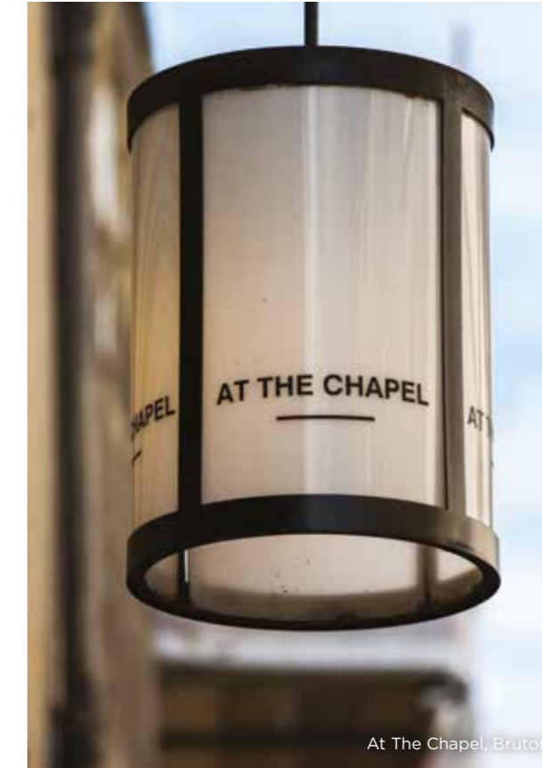
At The Chapel, Bruton

Babington House in Frome is less than 30 minutes drive away. This exclusive club offers members the use of the stunning house and grounds plus a spa, outdoor pool and various restaurants.