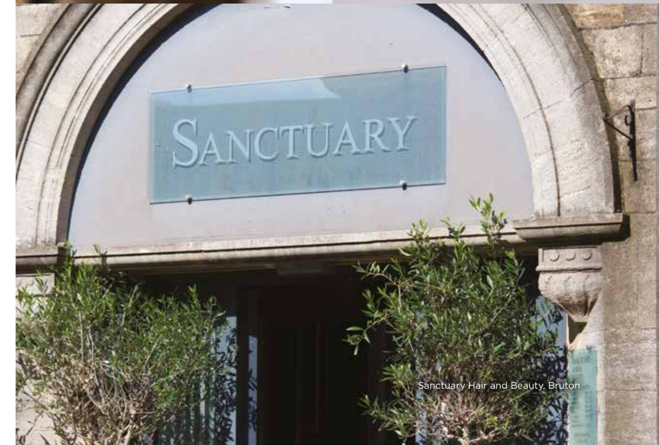
Sanctuary Hair and Beauty, Bruton