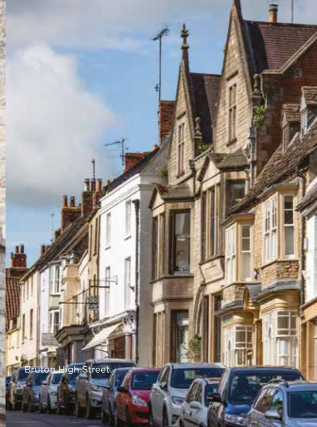
Bruton High Street