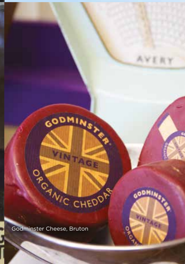
Godminster Cheese, Bruton