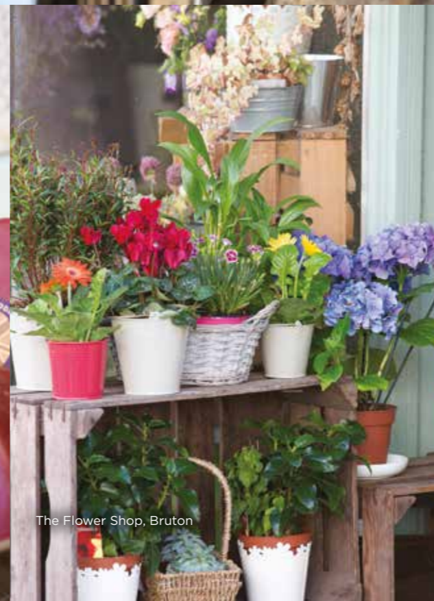
The Flower Shop, Bruton

Pretty much everything you need can be sourced locally from this idyllic but vibrant little town.