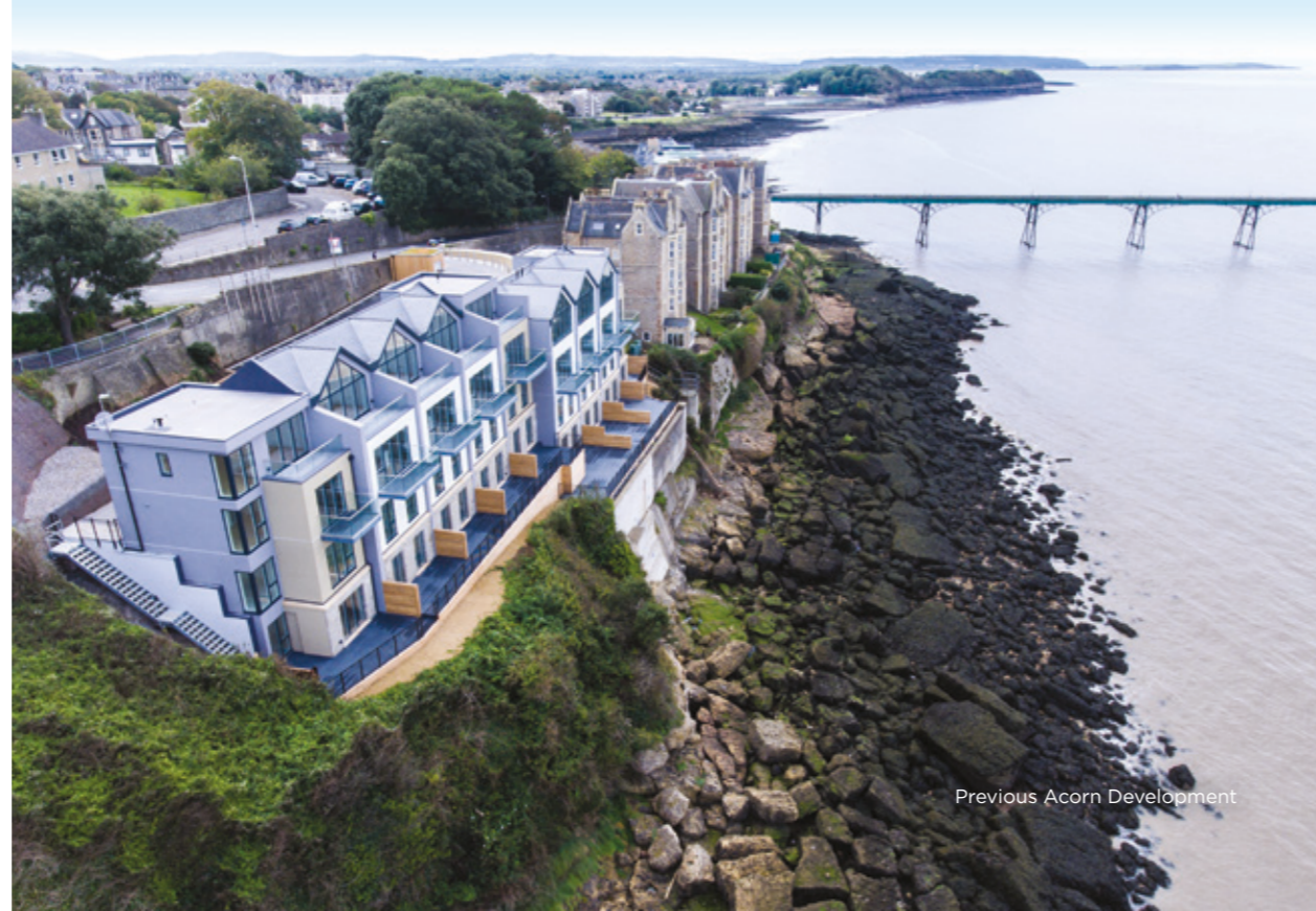
Previous Acorn Development