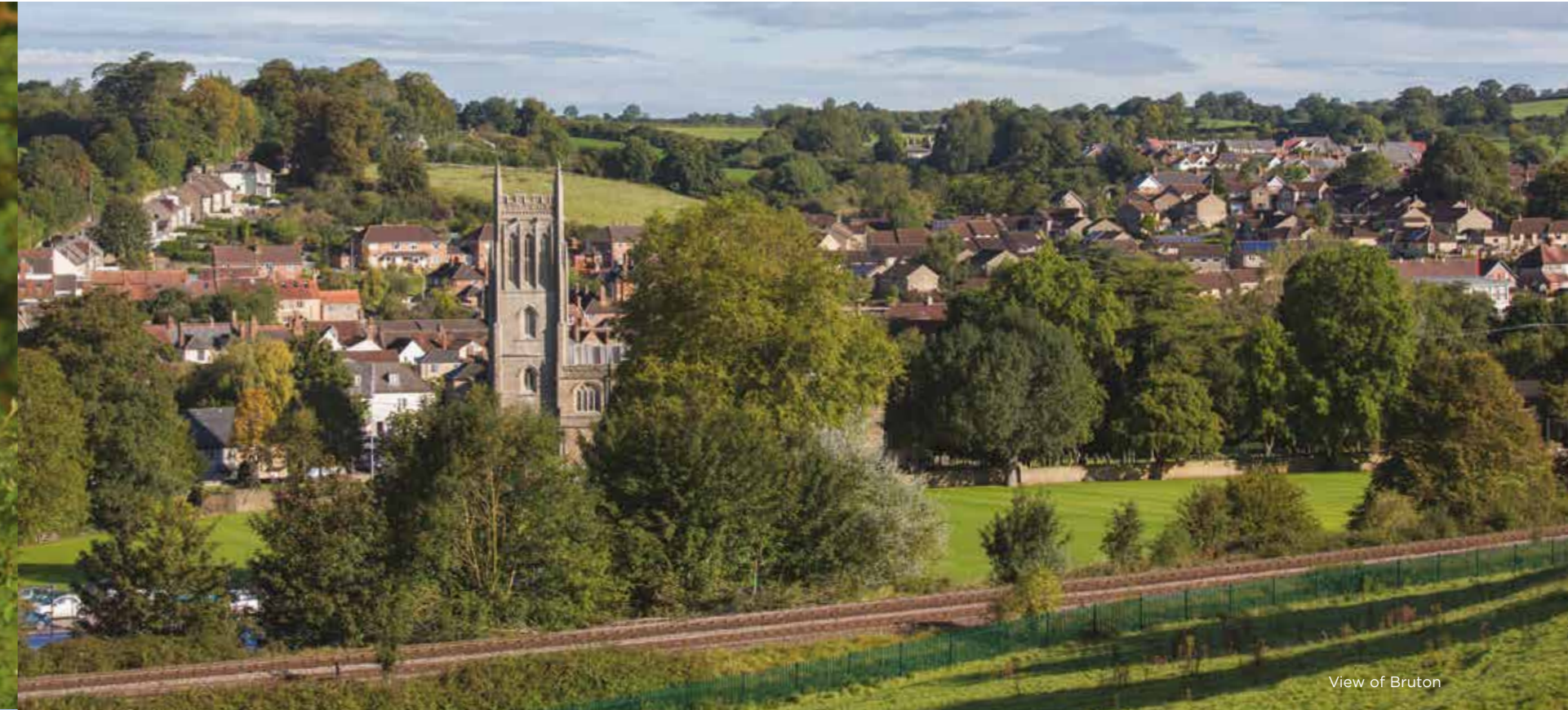
View of Bruton