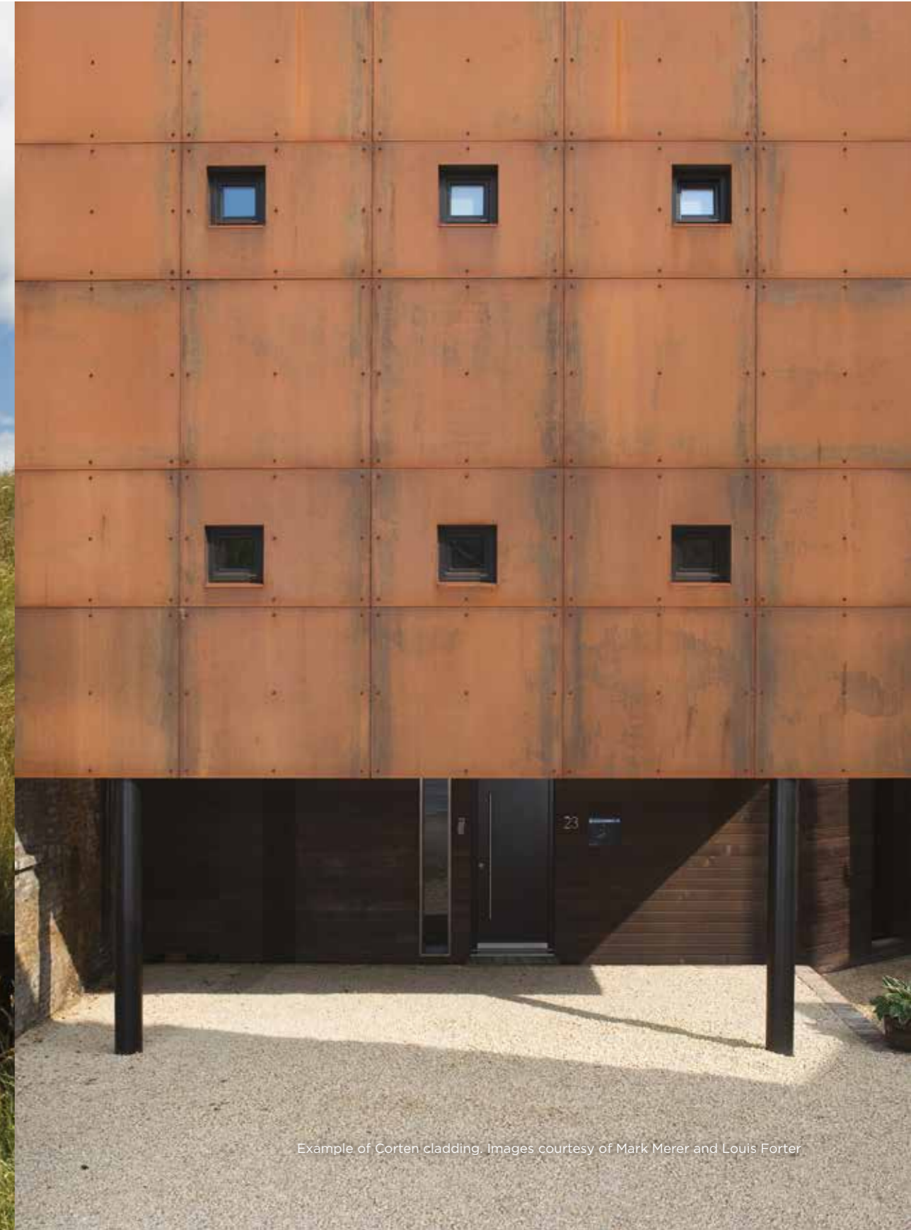
Example of Corten cladding. Images courtesy of Mark Merer and Louis Forster