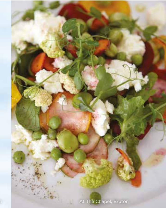
At The Chapel, Bruton