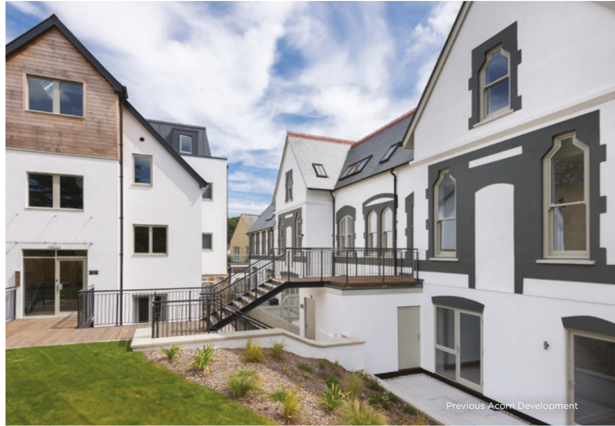
Previous Acorn Development

For further information contact Acorn 0117 244 0400 www.acornpropertygroup.org