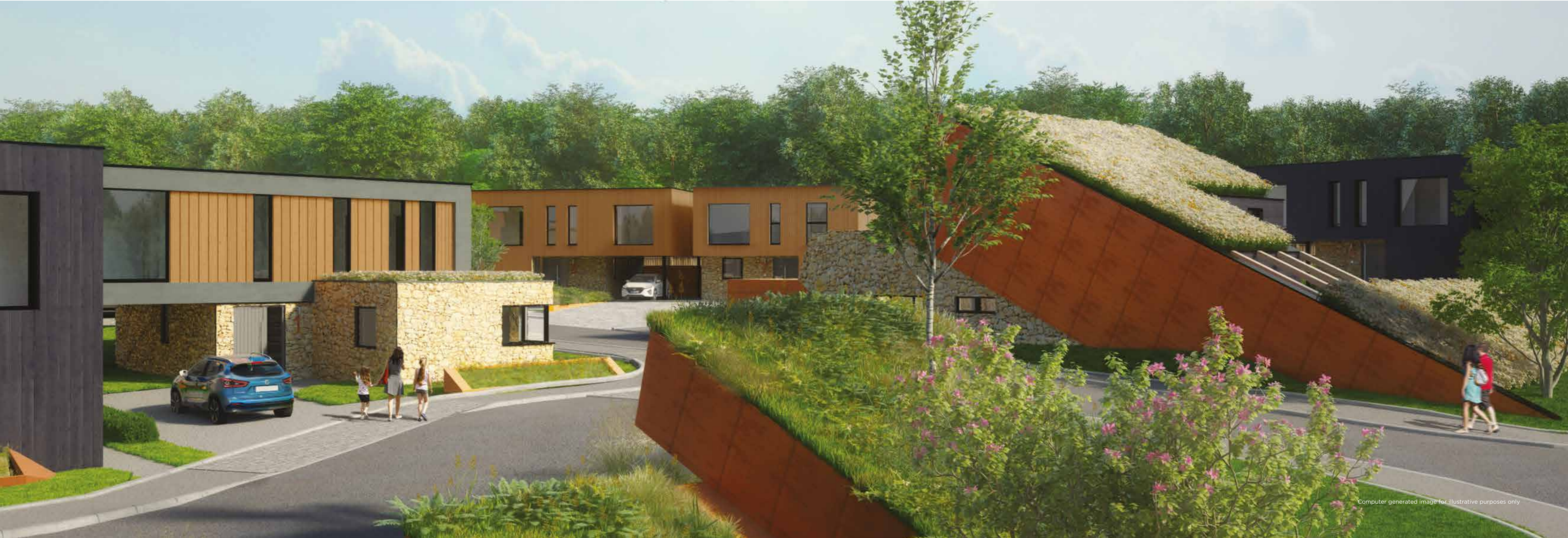
Computer generated image for illustrative purposes only