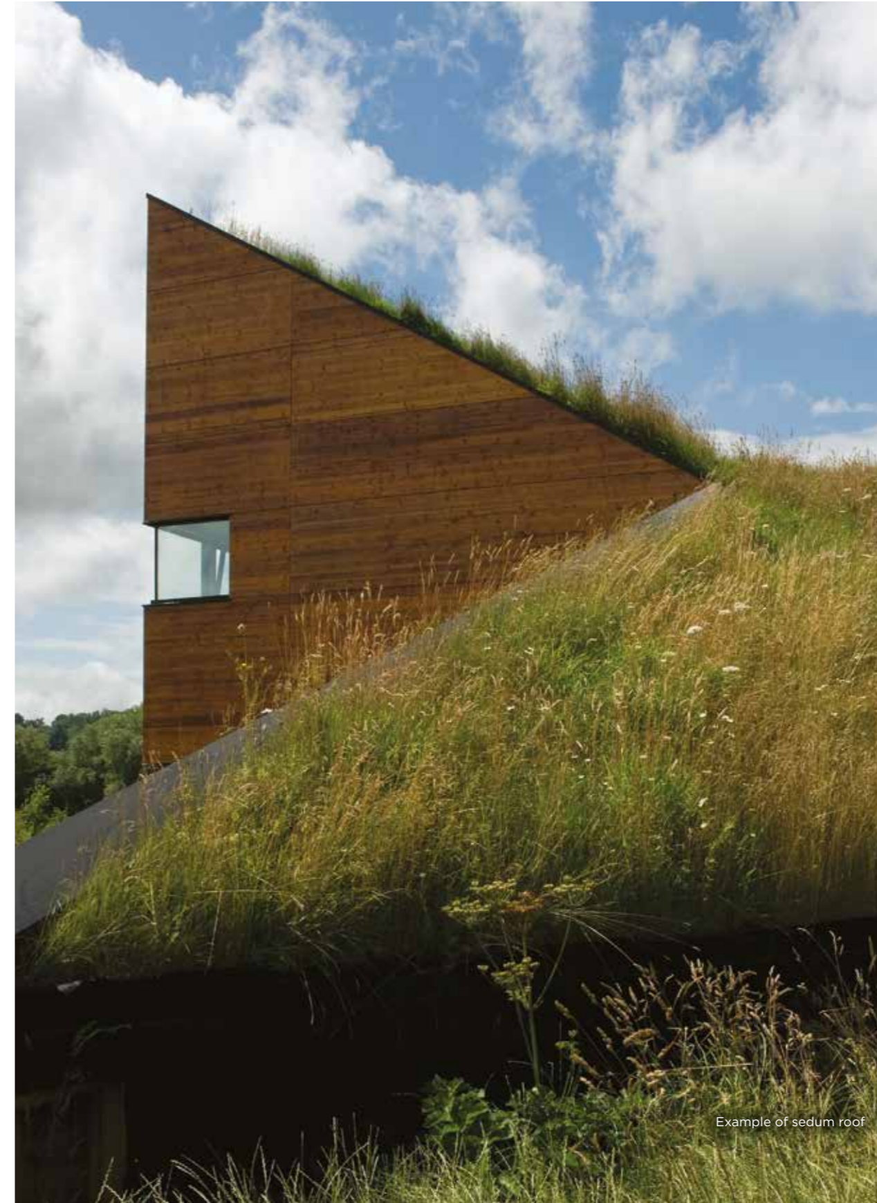
Example of sedum roof

An ecology corridor to the north and west boundaries of the site has been proposed to protect wildlife including birds, bats and hedgehogs using the hedgerow. Eight forms of bat and bird boxes will be installed on properties and trees within the development to deliver additional biodiversity enhancement.