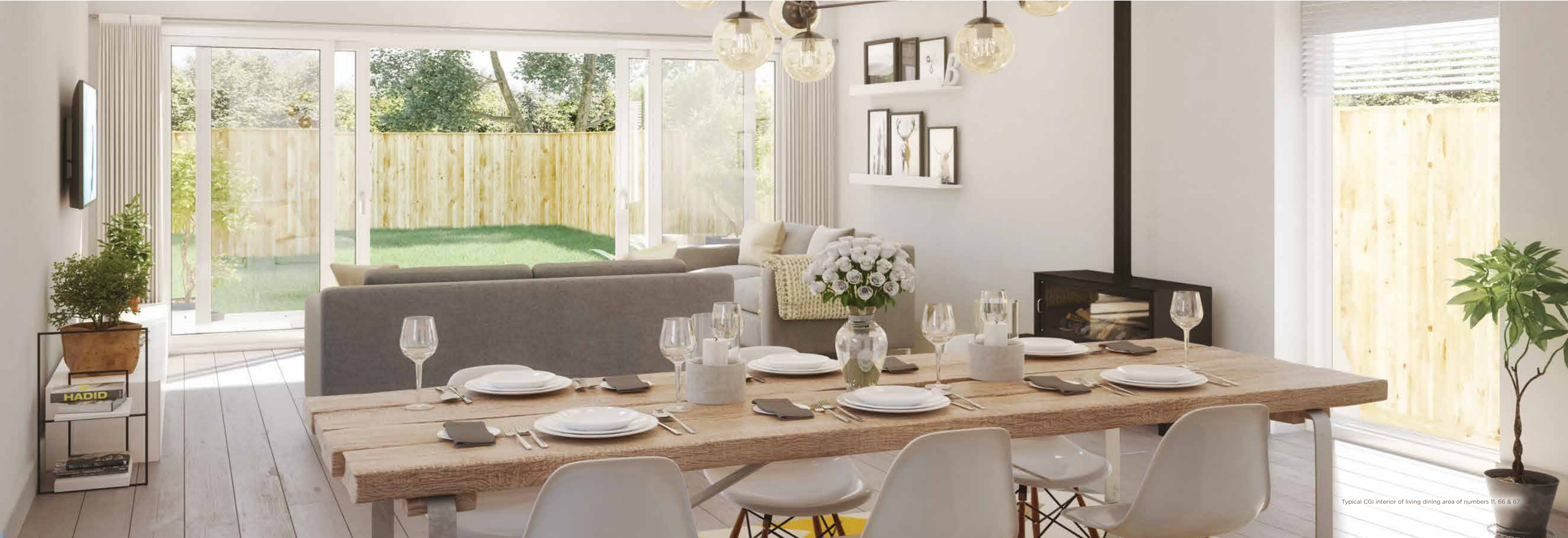
Typical CGI interior of living dining area of numbers 11, 66 & 67