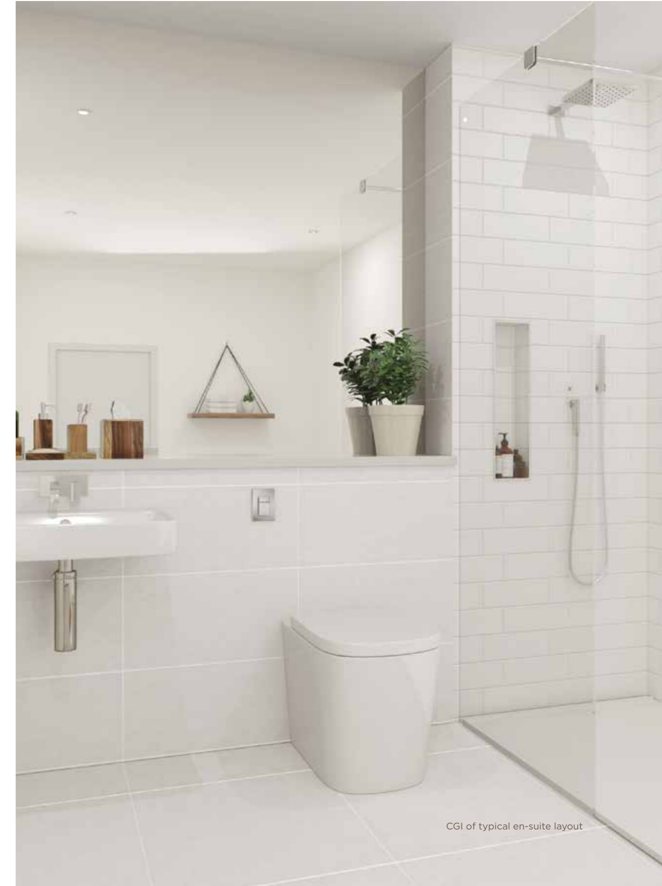
CGI of typical en-suite layout

The specification is intended as a guide only. Acorn Property Group reserve the right to alter the specification at any time.