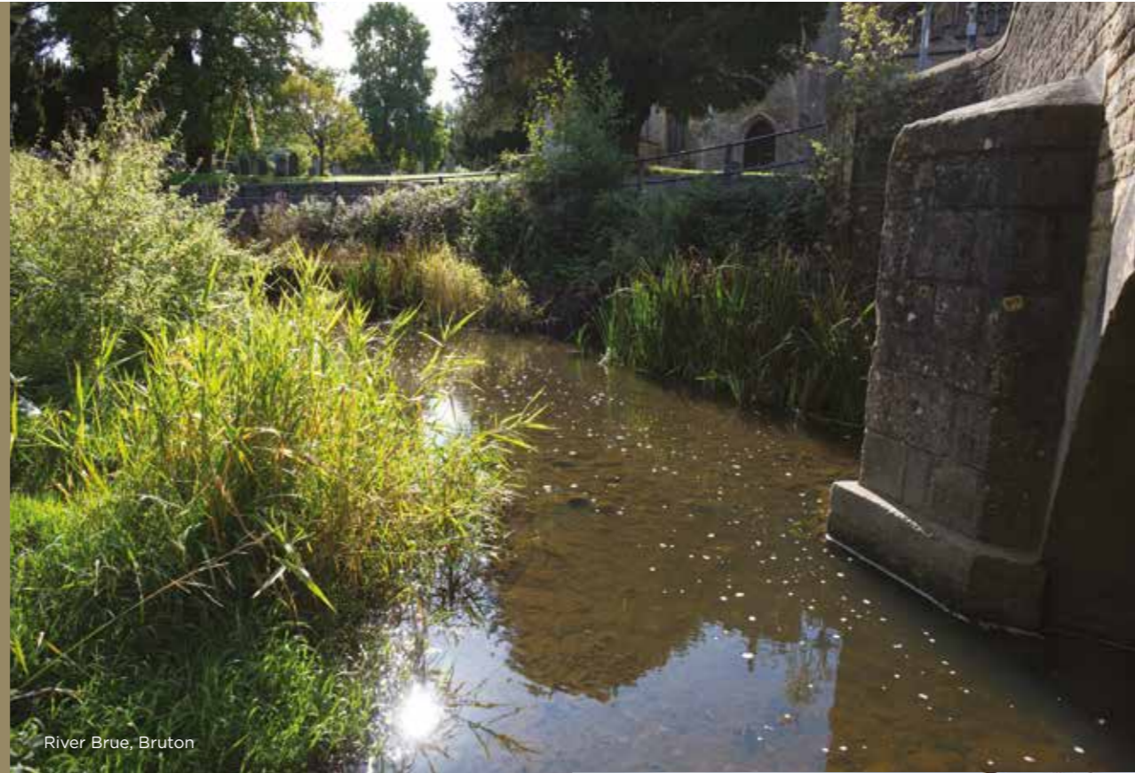
River Brue, Bruton

Although a rural town, Bruton has remarkably good transport links with an excellent local bus service. Bruton Train Station is a 10-minute walk from the town centre with connections including Bristol, Bath and London.