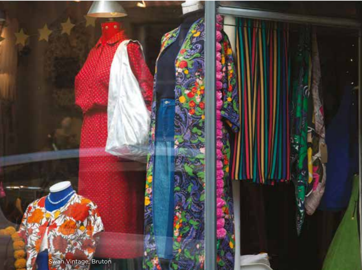
Swan Vintage, Bruton