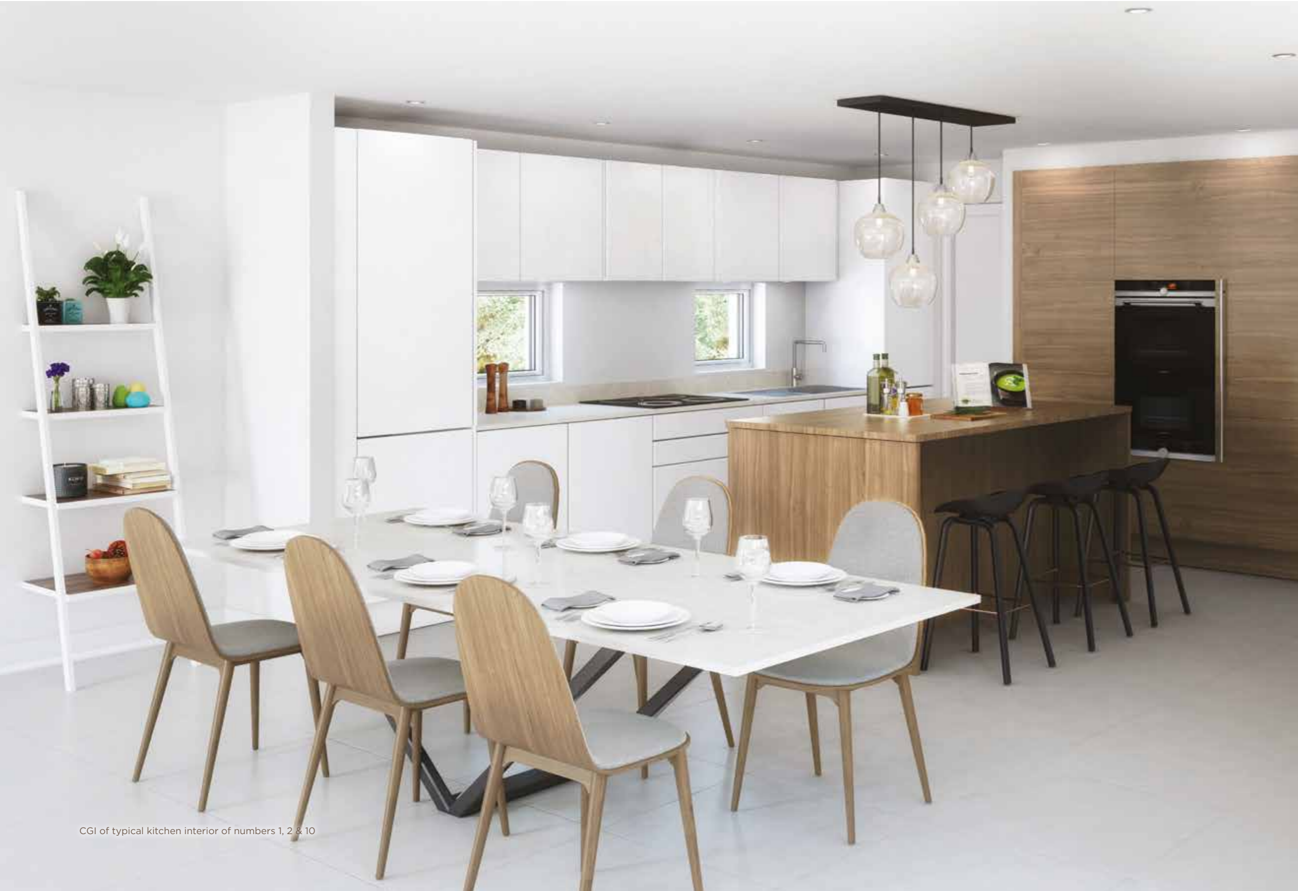
CGI of typical kitchen interior of numbers 1, 2 & 10