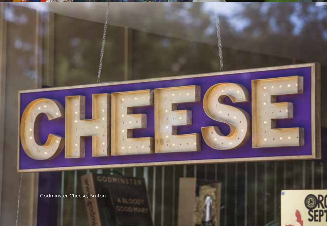
Godminster Cheese, Bruton